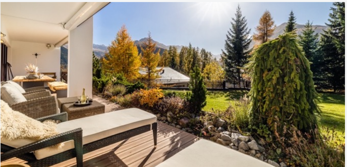
Sitting area basefloor