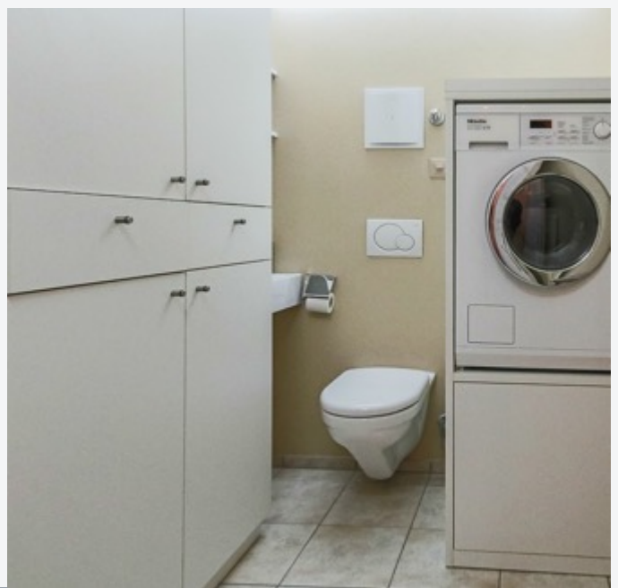
2 separate toilets