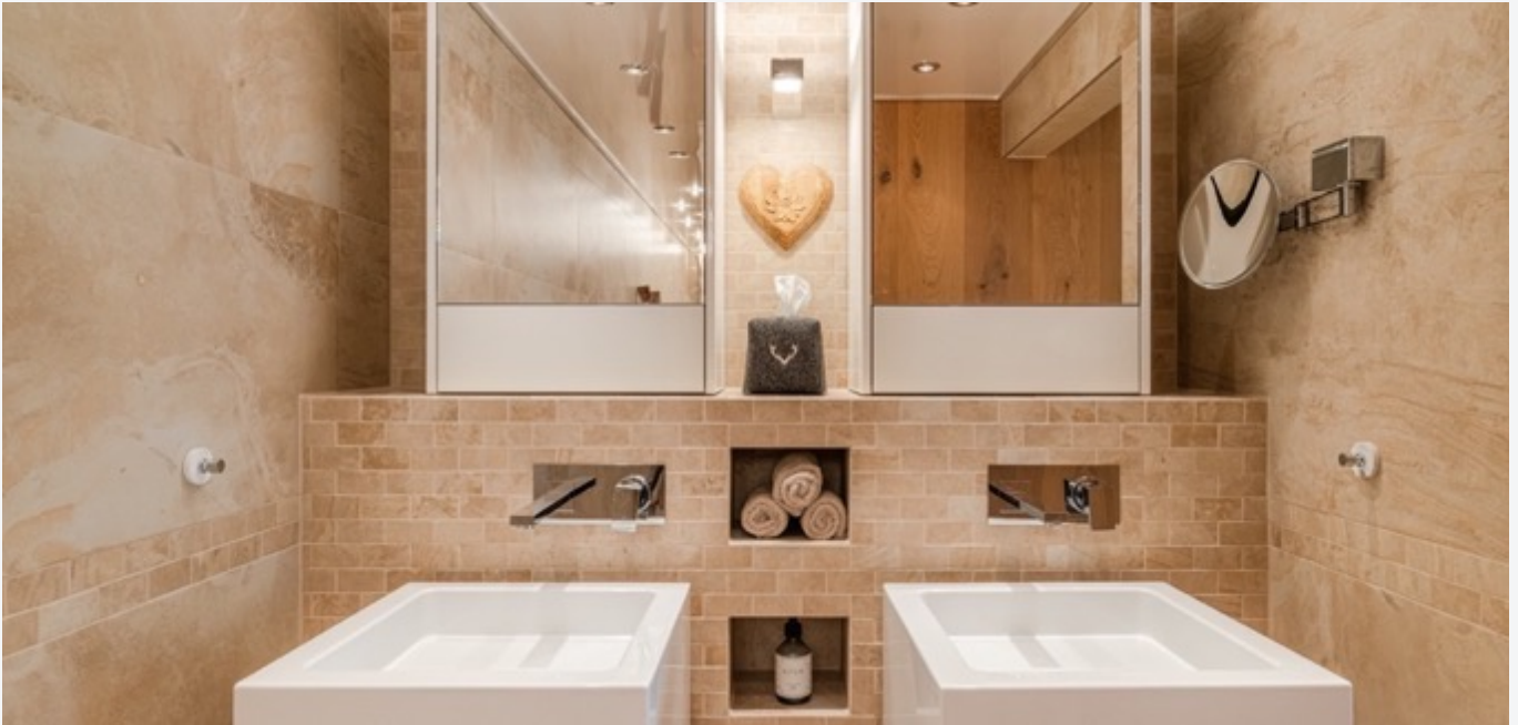
Bathroom with bathtub and shower