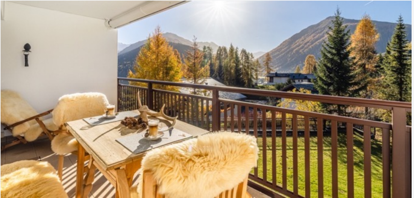
Balcony upper floor