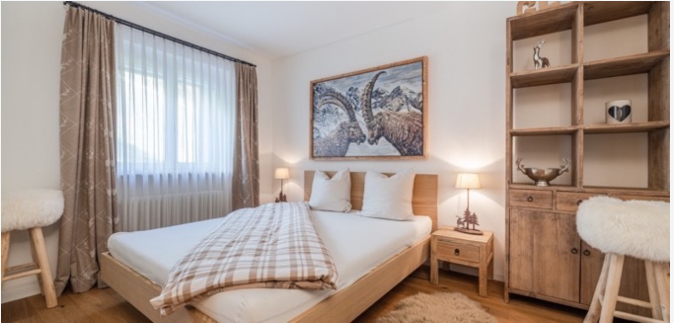
Separate 1 rom studio with 180cm bed