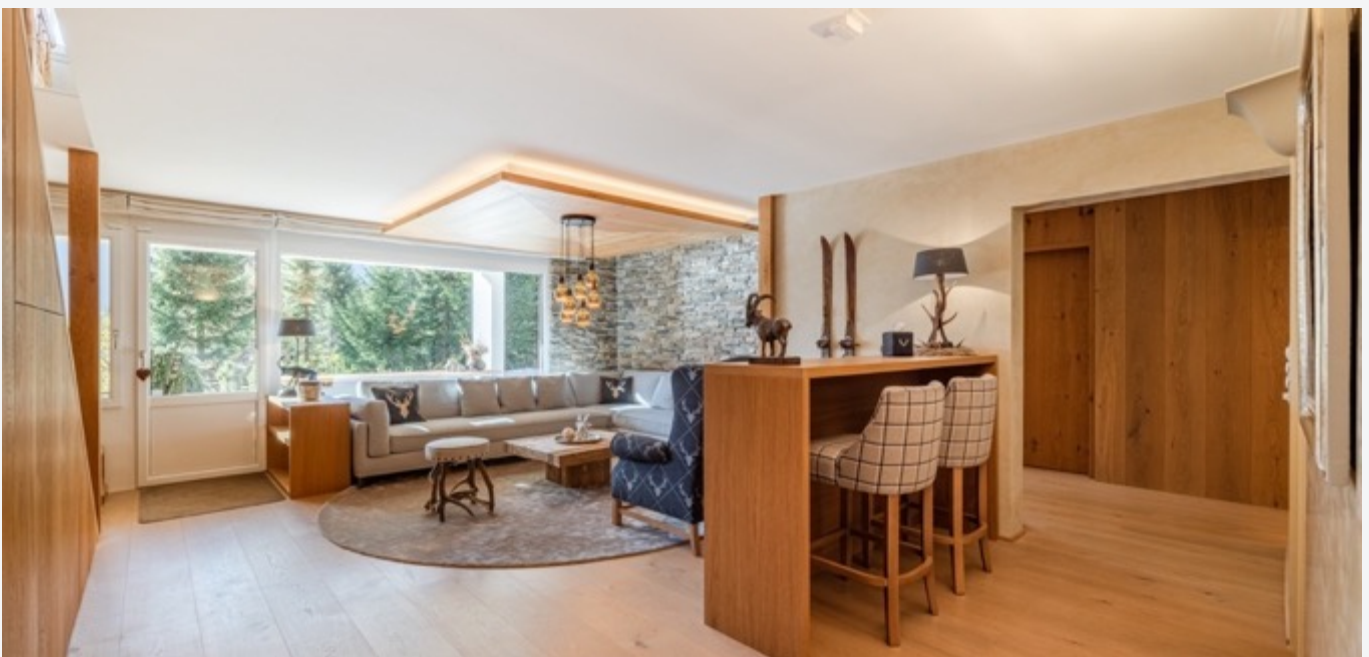
Living room downstairs with outside sitting area