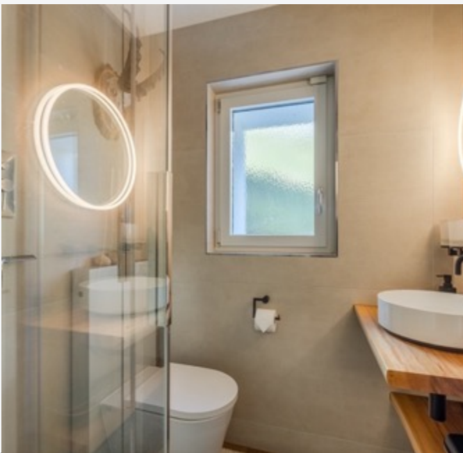
with ensuite bathroom