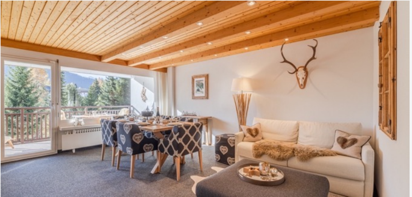
Living room upstairs with balcony