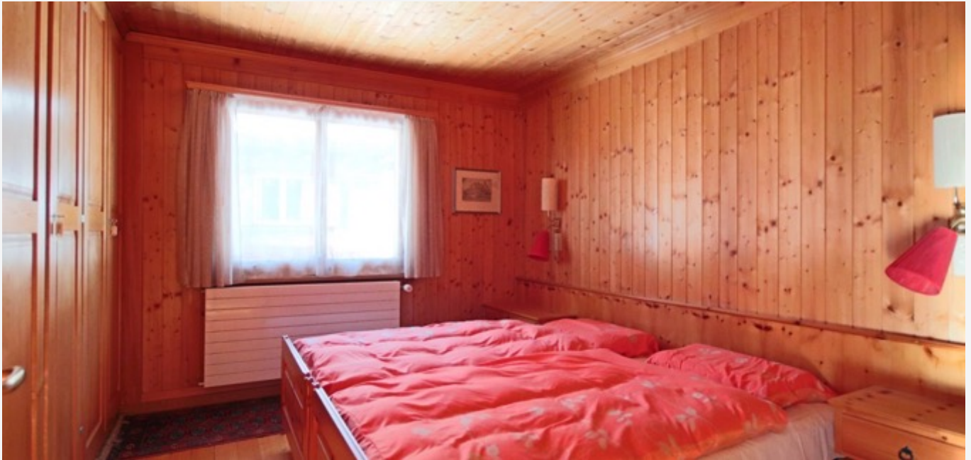
Sleeping room on ground floor: 180 cm double bed