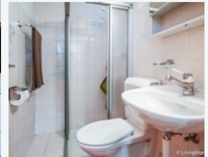
Separate room on basement floor: 180 cm double bed, separate bathroom and private entrance