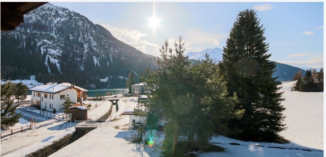
Balcony with view to lake Davos