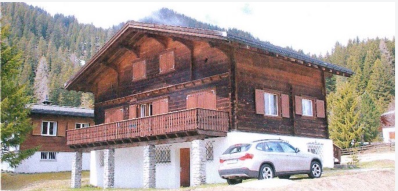
Building from outside